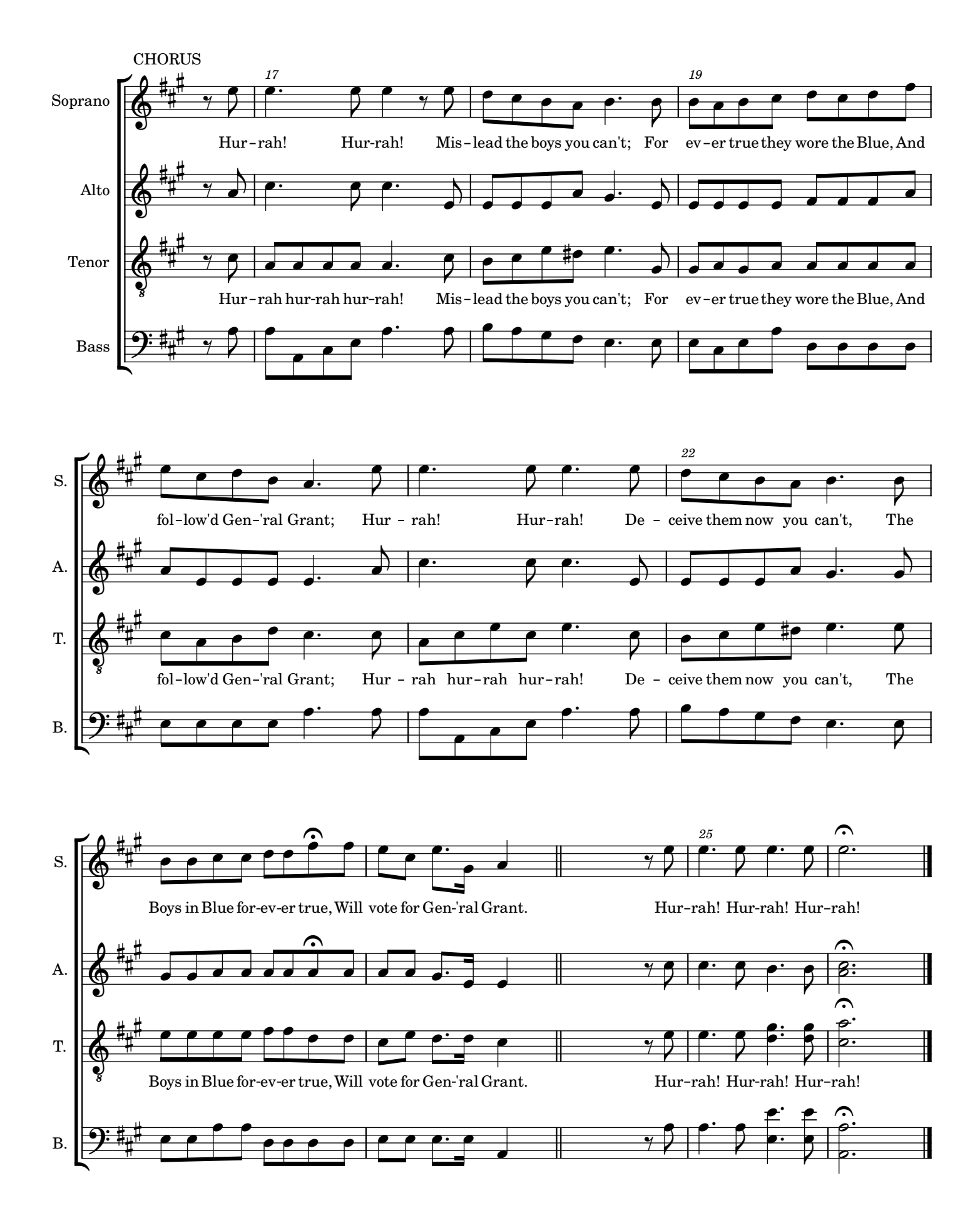
Published in The Grant Songster. For the Campaign of 1868. Root & Cady, 1868.